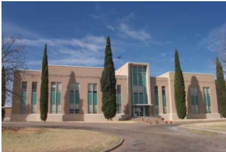
Upton County Courthouse - Rankin, Texas

This report is part of a comprehensive project to assess the Health and Behavioral Health Needs of vulnerable populations in a twenty-county region of West Texas. The region covers Coke, Concho, Crockett, Edwards, Irion, Kimble, Kinney, Mason, McCulloch, Menard, Mills, Reagan, Runnels, San Saba, Schleicher, Sterling, Sutton, Tom Green, Upton, and Val Verde counties. The set of project documents includes a report for each county and a comprehensive regional-level assessment.