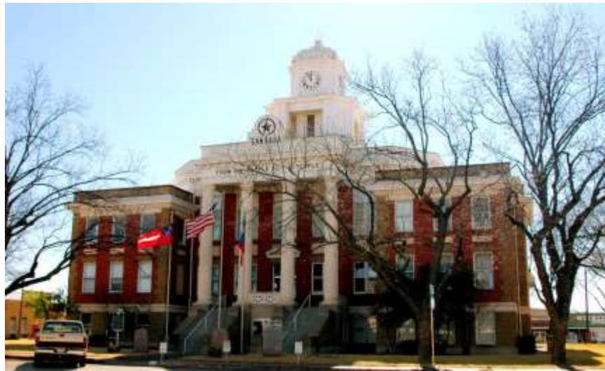
San Saba County Courthouse – San Saba, Texas

This report is part of a comprehensive project to assess the Health and Behavioral Health Needs of the Extremely Poor in a 20-county region of West Texas. The regional assessment includes Coke, Concho, Crockett, Edwards, Irion, Kimble, Kinney, Mason, McCulloch, Menard, Mills, Reagan, Runnels, San Saba, Schleicher, Sterling, Sutton, Tom Green, Upton, and Val Verde counties. The set of project documents includes a report for each county, plus a regional-level assessment.